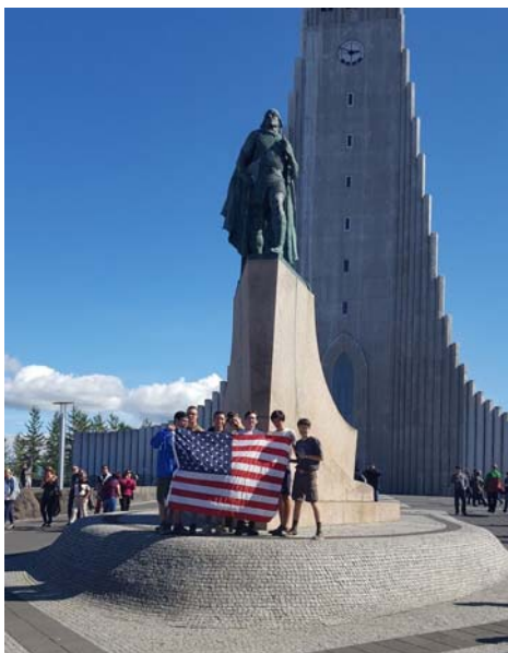
Our contingent at the Leifur Eiríksson Statue in Reykjavik. The statue was a gift of the USA to Iceland.

Your council International Committee is a good place to start getting information on international Scouting and world jamborees. The BSA International Division maintains a list of world scouting events in newsletters and web pages on the BSA website at: www.scouting.org/Home/International.aspx .