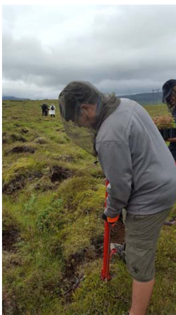
Tree planting at Úlfjótssvatn