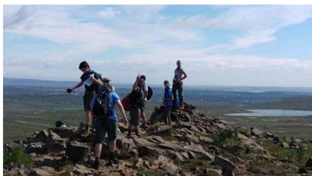
Tree planting at Úlfjótssvatn

Our scouts had many opportunities to meet and socialize with many scouts (both boys and girls), and had opportunities to share adventures, trade patches, and attend the excellent opening, closing, and international culture ceremonies.